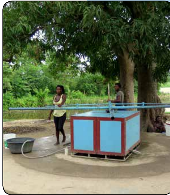
Village of Garde Saline, Haiti

Proceeds from this ride support Rotary International Water & Sanitation projects like these.